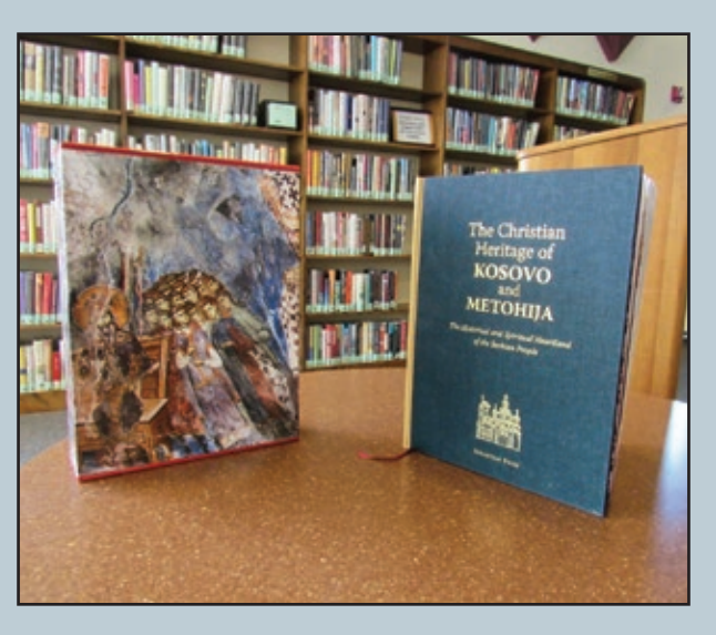
The book Christian Heritage of Kosovo and Metohija

More information about the book is available on the website of the Western American Diocese of the Serbian Orthodox Church in North and South America: http://www.westsrbdio.org/ .